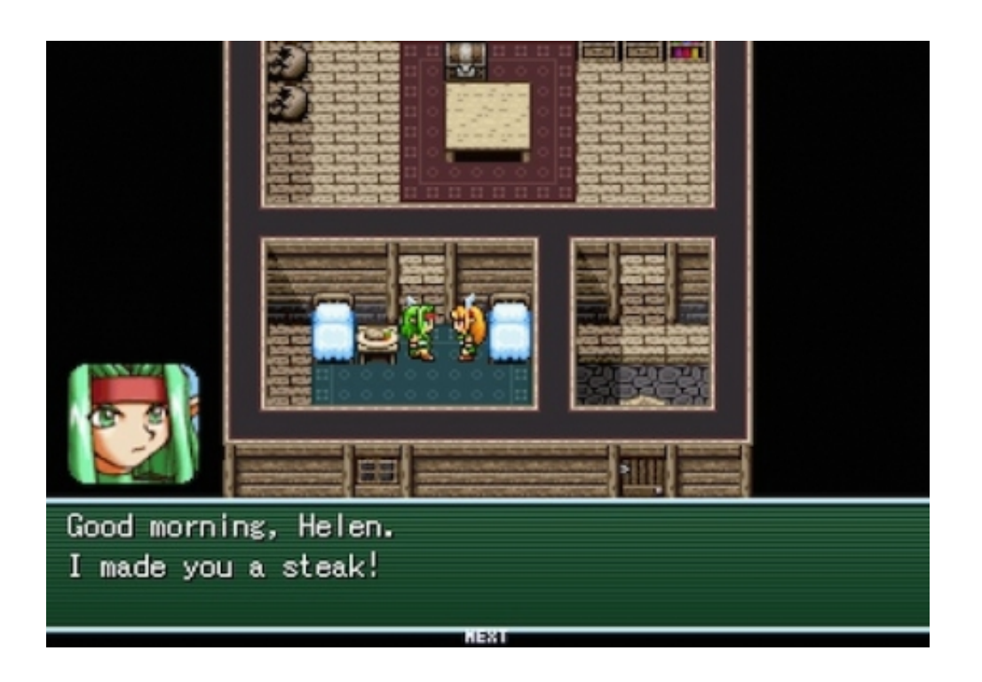
RPG Maker MV - Fantasy Heroine Character Pack 2 Activation Key Crack